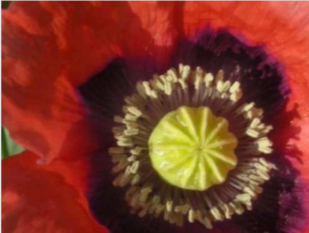
Poppies, a symbol of May's Memorial Day.

NEW EDUCATION NEWSLETTER! Advanced Biofuels USA sends three newsletters: Conference Calendar ; Policy, Legislation, Regulations, Happenings ; and a NEW Education Newsletter . All can be found archived on our NEWS page . Click here to see an example of the New Education Newsletter. And Click HERE to Subscribe (Free) .