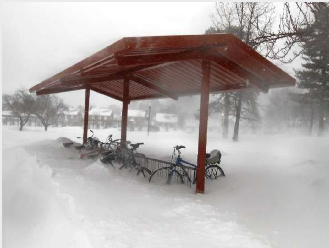
Going Nowhere Fast. On the other hand, easier to extract a bike from two feet of snow than a car.