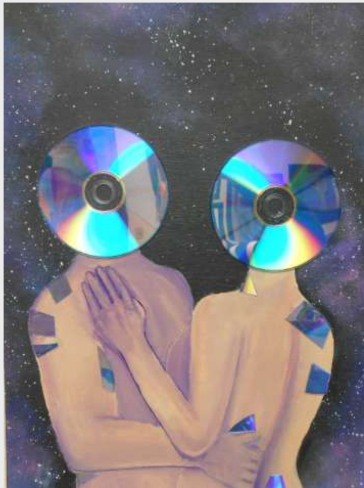
How we connect in the 21st century.