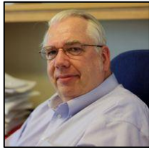
Charles Forsberg MIT Nuclear Science