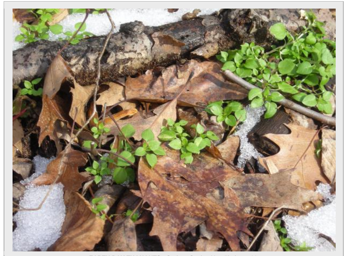
EARTH DAY THOUGHTS: Carbon Cycle. New life from old.